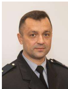
Oleg ZHURAVEL ©