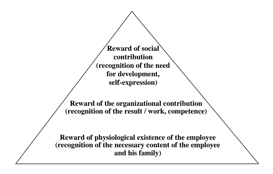
Figure 2. The structure of the employee's reward

remuneration inherent in advanced socio-economic (industrial) relations<sup>7</sup>.